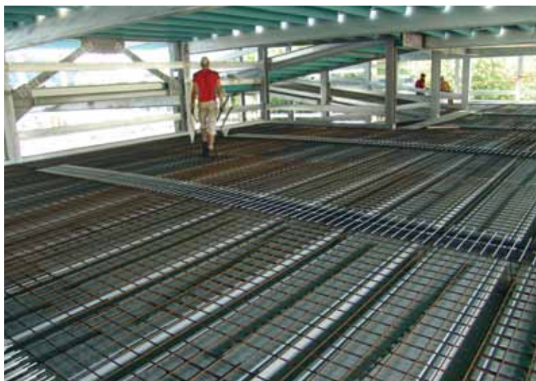
Multi-storey car park in the Gesundheitszentrum an der Nahe (health centre) in Bad Kreuznach