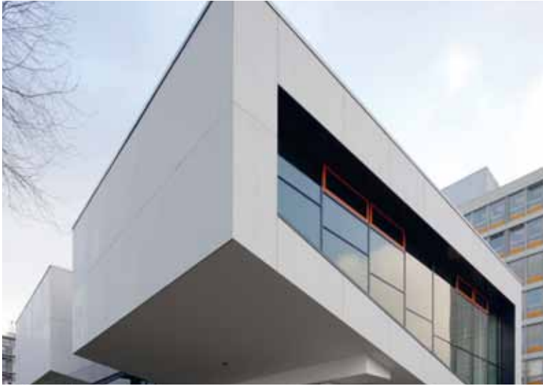
Façade panels on the lecture building at RWTH Aachen