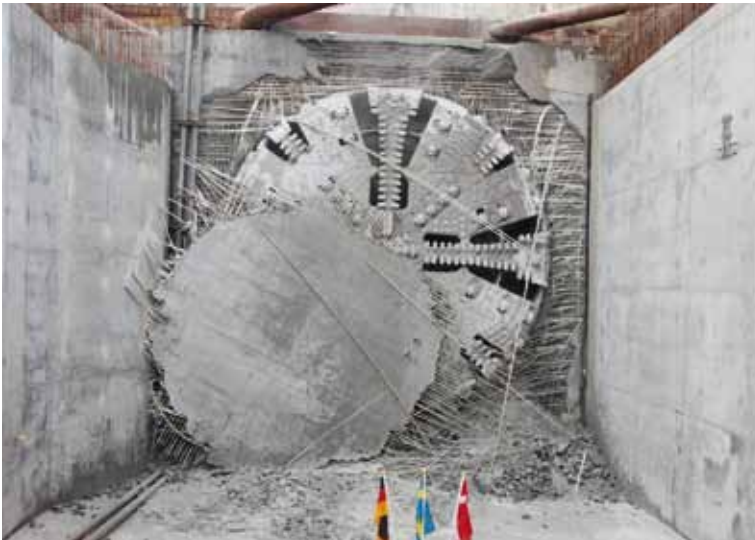
Central Station, City Tunnel Malmö, Sweden