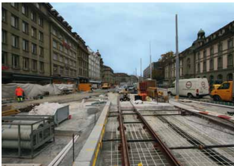
Station square, Bern, Switzerland