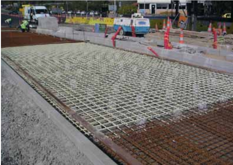
Gare de Péage de Tain, southern France