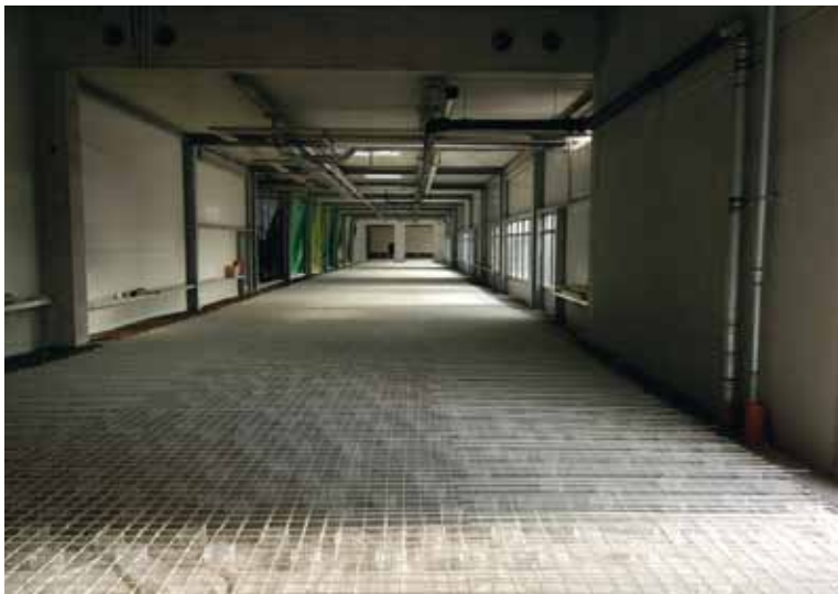
FTS Niederrhein Gold Hall Froog Complex in Moers