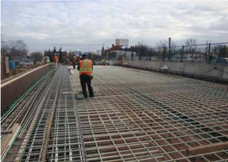
Weightman Bridge, Niagara Falls, Ontario, Canada