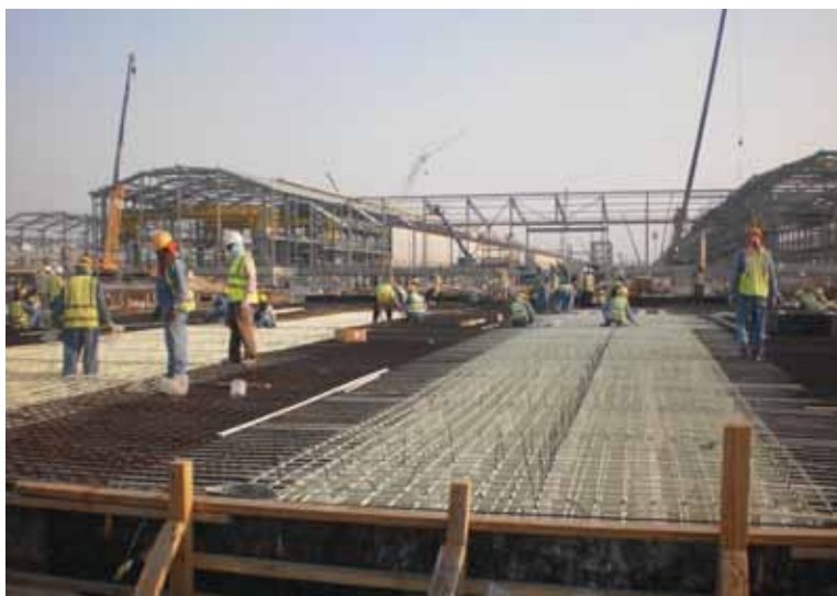
Ras Al Khair Aluminium Factory Jubail, Saudi Arabia