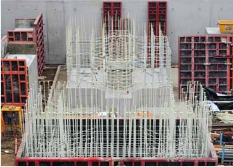
Max Planck Institute for Solid State Research in Stuttgart